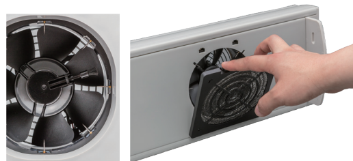
Auto-Cleaning Brush and Grille Opening