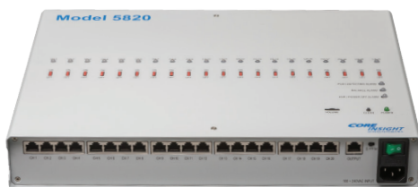
Model 5808, 5820 Ionizer Monitoring System