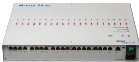
Model 5820 Ionizer Monitoring System