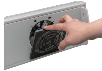
Auto-Cleaning Brush and Grille Opening