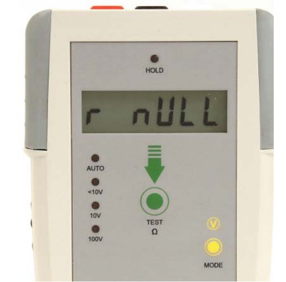
Figure 17: Press MODE to select NULL process