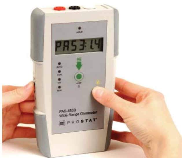
Figure 15: Press and Hold the MODE button while sliding the Main Power to ON.