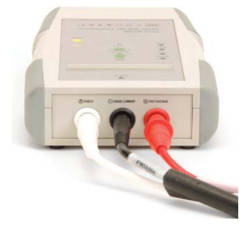
Figure 7: Test Lead Connections: White = Shield Black = Current Sensing Red = Test Voltage

B. The MODE button performs four useful functions: