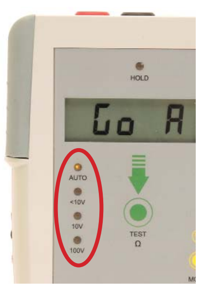
Figure 12: Manual Mode