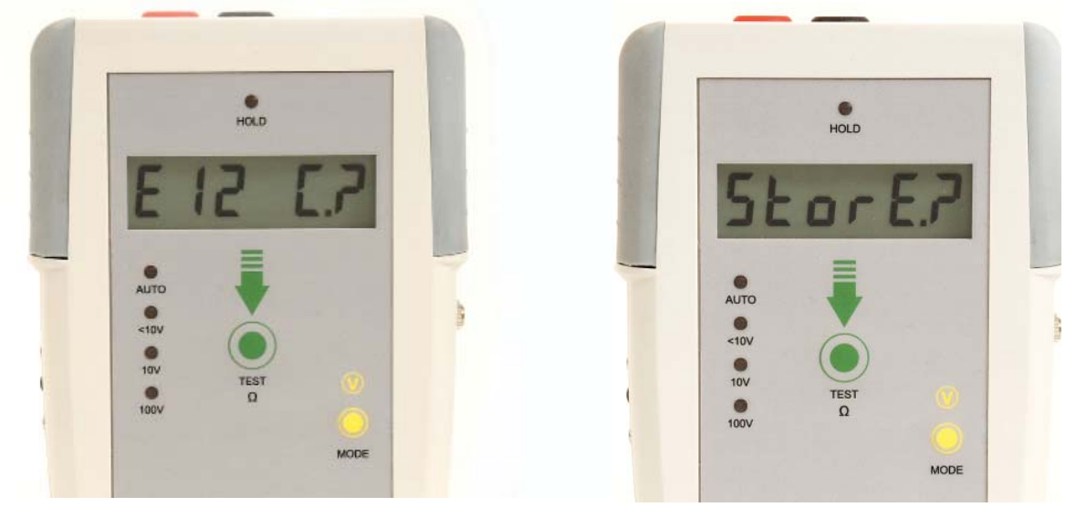
Figure 19: E12 C? and StorE? will display