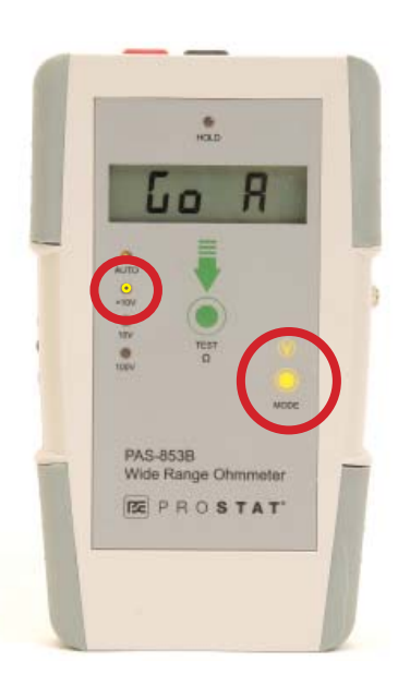
Figure 4: Press MODE to manually Change Test Voltage