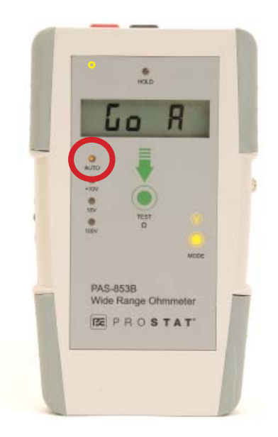
Figure 11: Automatic Mode