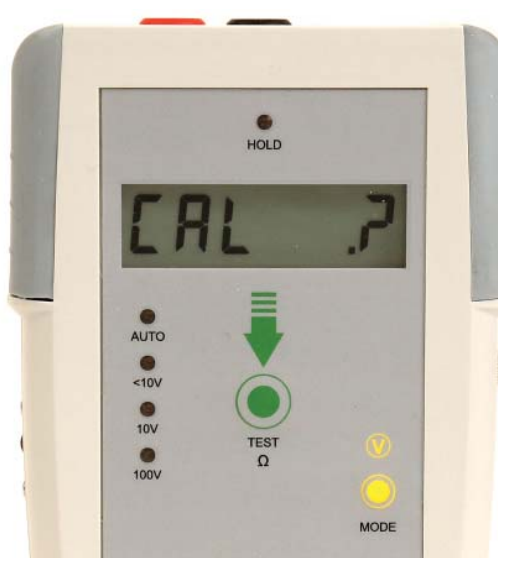
Figure 16: CAL? will be displayed.