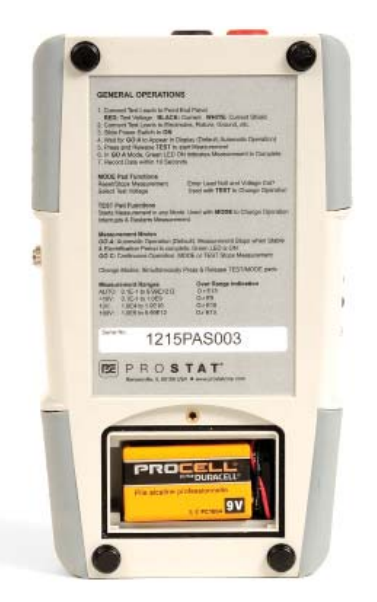
Figure 21: Battery Replacement