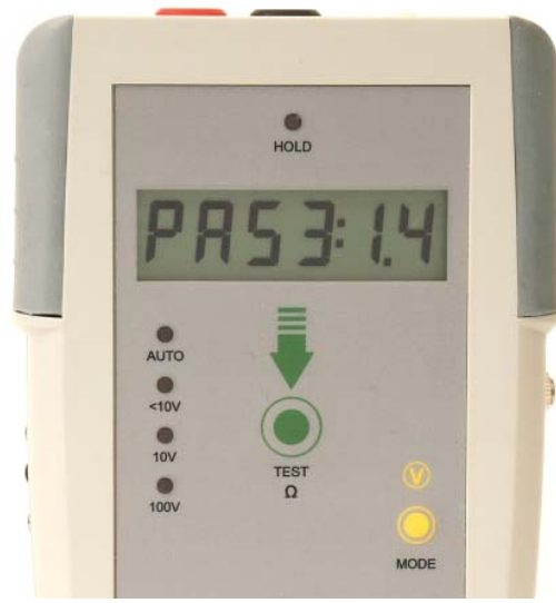
Figure 20: Firmware version

5. Once the lead resistance is stored in memory, the unit restarts. During startup the instrument firmware ID version is displayed when the instrument is ready to take measurements Go A is displayed.