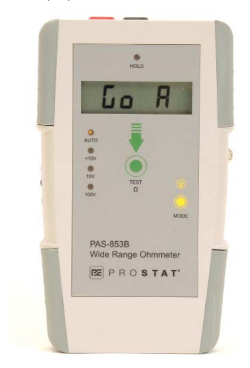
Figure 3: PAS-853B in Continuous

1. AUTO mode (Displayed as GO A): Automatically adjusts resistance range, test voltage and Electrification Period (EP). Measurements stops at the end of EP, Green LED is ON , measurement is displayed for 10 seconds then instrument resets for the next measurement.