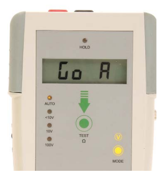
Figure 20: Firmware version