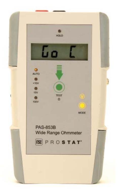
Figure 3: PAS-853B in Continuous Operation Mode