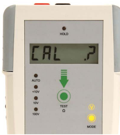
Figure 16: CAL? will be displayed.