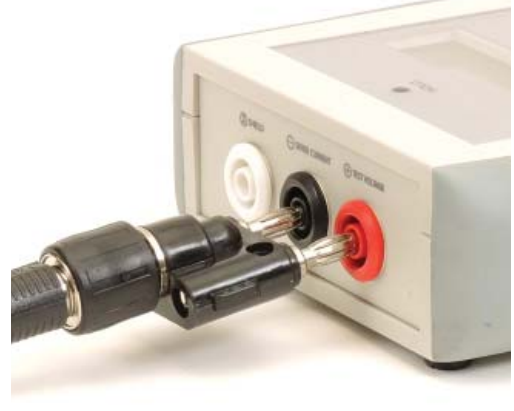
Figure 9: The shield is connected to the meter via the White banana plug and receptacle