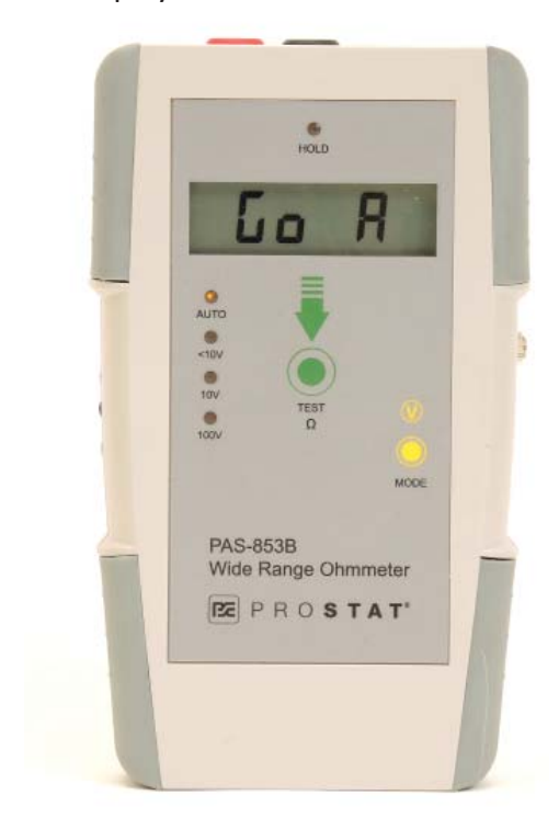
Figure 2: PAS-853B in AUTO - Default Operation Mode

1. AUTO mode (Displayed as GO A ): Automatically adjusts resistance range, test voltage and Electrification Period (EP). Measurements stops at the end of EP, Green LED is ON , measurement is displayed for 10 seconds then instrument resets for the next measurement.