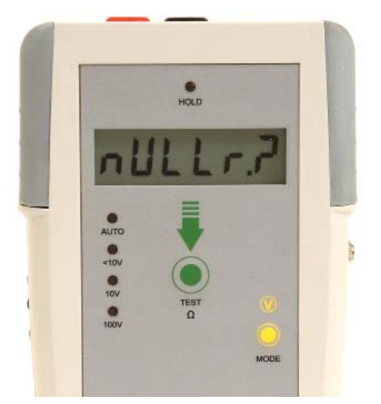
HOLD HOLD AUTO COV TEST 100V MODE

2. While CAL? is displayed press MODE one time and nULLr? will be displayed.