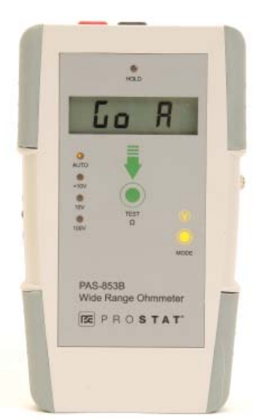
Figure 8: Mode Sequnce