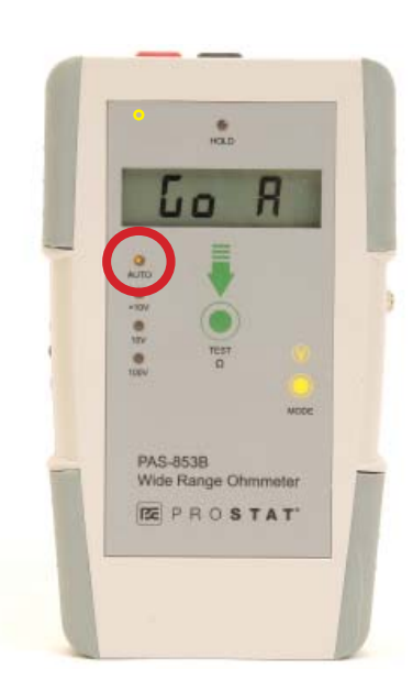
Figure 11: Automatic Mode