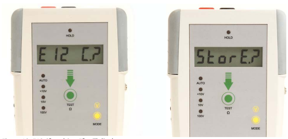
Figure 19: E12 C? and StorE? will display