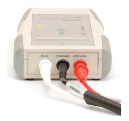
Figure 7: Test Lead Connections: White = Shield Black = Current Sensing Red = Test Voltage

B. The MODE button performs four useful functions: