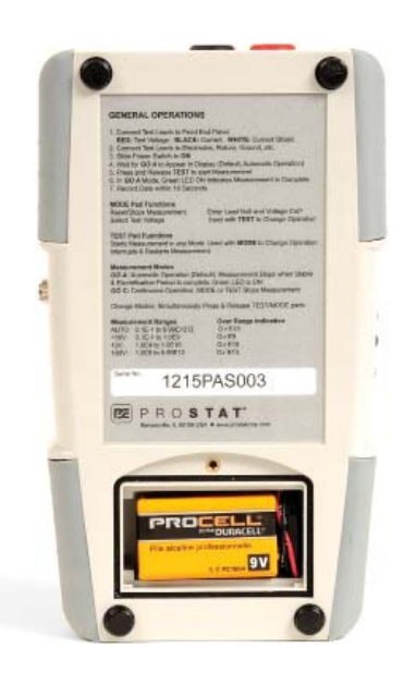
Figure 21: Battery Replacement