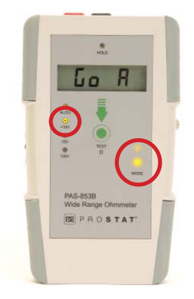
Figure 4: Press MODE to manually Change Test Voltage