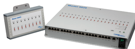
Model 5820 Ionizer Monitoring System