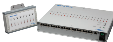
Model 5820 Ionizer Monitoring System