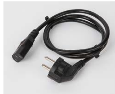
AC Power Cable