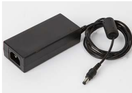
24V DC Adapter