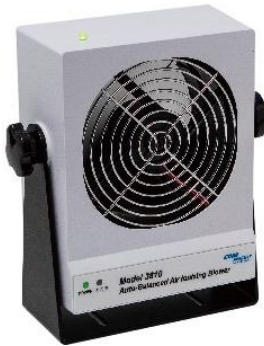
Model 3810 Ionizer