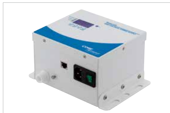
Model 620 Power Supply Advanced Pulsed AC Technology