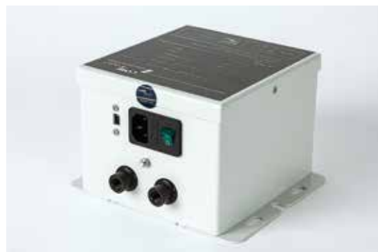
Model 610 Power Supply

Shockless Static Neutralizing Ion Bar Very Efficient and Various Applications Small Size to Fit in Tight Spaces Web base Roll to Roll Process Static Control Solar Panel Particle Contamination Control Flat Panel Display Static Control Most Industrial Applications